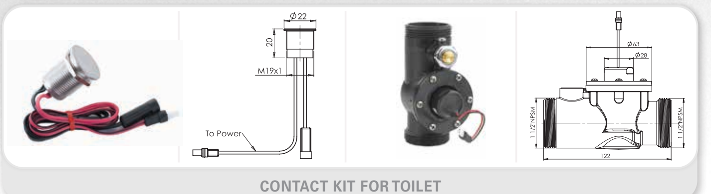
CONTACT KIT TON TOILLT